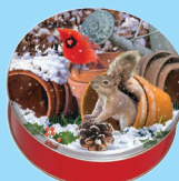
Garden Friends Holiday Tin w/Milk Chocolate Pretzels

NEW Snack Product: Vanilla Honey Roasted Pecans (online only)