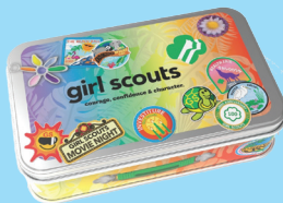
Girl Scouts Tin w/Mint Treasures